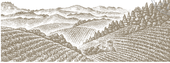
Stags Leap District Vineyard - our winery’s home

We introduced the new look of Pine Ridge Vineyards in the last newsletter and hopefully you have had a chance to examine it first-hand when your shipment of the 2006 Napa Valley Cabernet Sauvignon arrived. This new design, and addition of “Vineyards” to our name, highlights the rare position Pine Ridge occupies in owning extensive estate vineyards spread amongst the best appellations of Napa Valley. Each of the appellation Cabernets features an artist’s illustration of one of our estate vineyards in that region, along with a seal noting the acreage within that district.